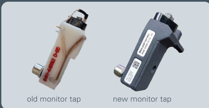
old monitor tap

The monitor tap has been redesigned comprehensively. Previously, the cables were inserted in cable guiding grooves, which were sealed with silicone.