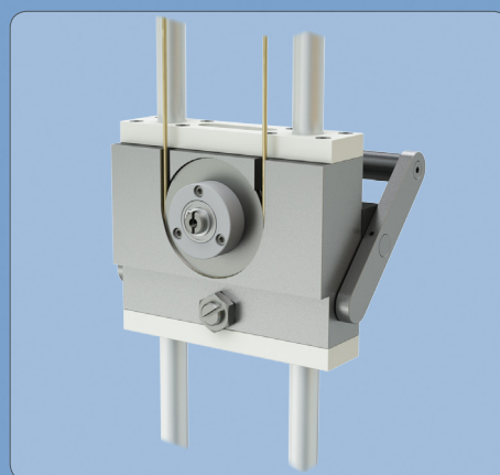
Simple wire guide on pulley